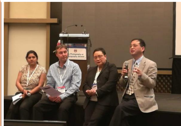
FOP WORKSHOP Q&A SESSION